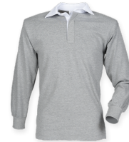
HEATHER GREY/ WHITE