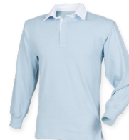
SKY BLUE /WHITE