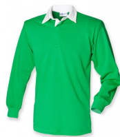
BRIGHT GREEN/ WHITE