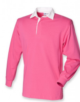
BRIGHT PINK/ WHITE