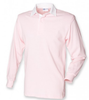
LIGHT PINK/ WHITE